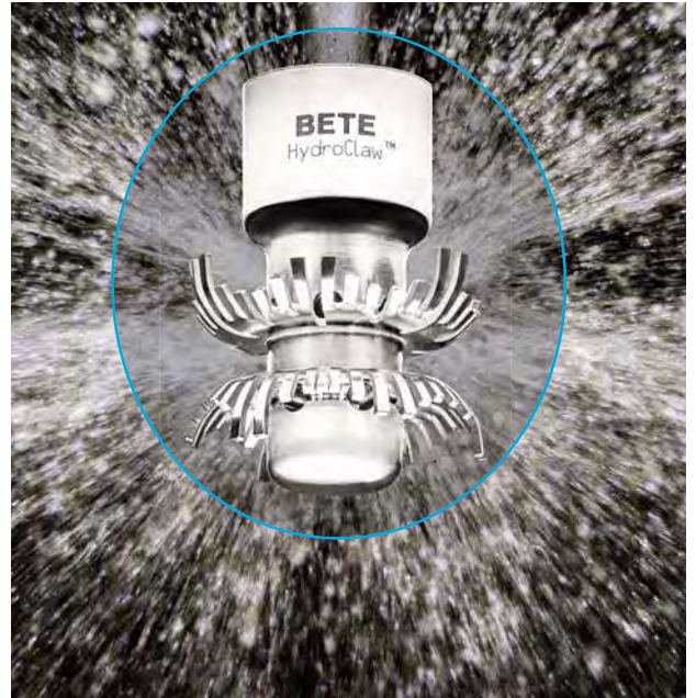
Fermentation tank cleaned with the HydroClaw