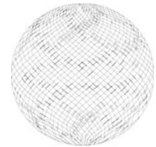
4 nozzle spray pattern

Performance may vary with ATEX and HR models.